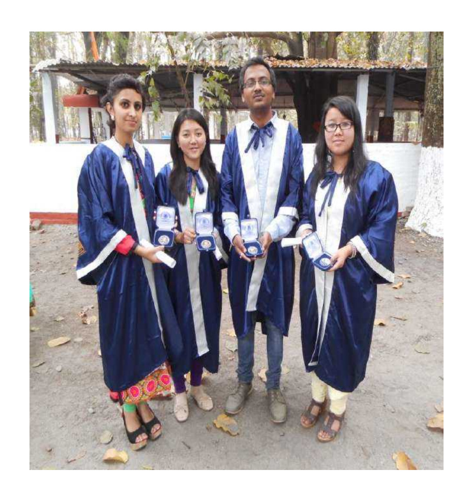
The Golden Moments: The College Gold Medalists